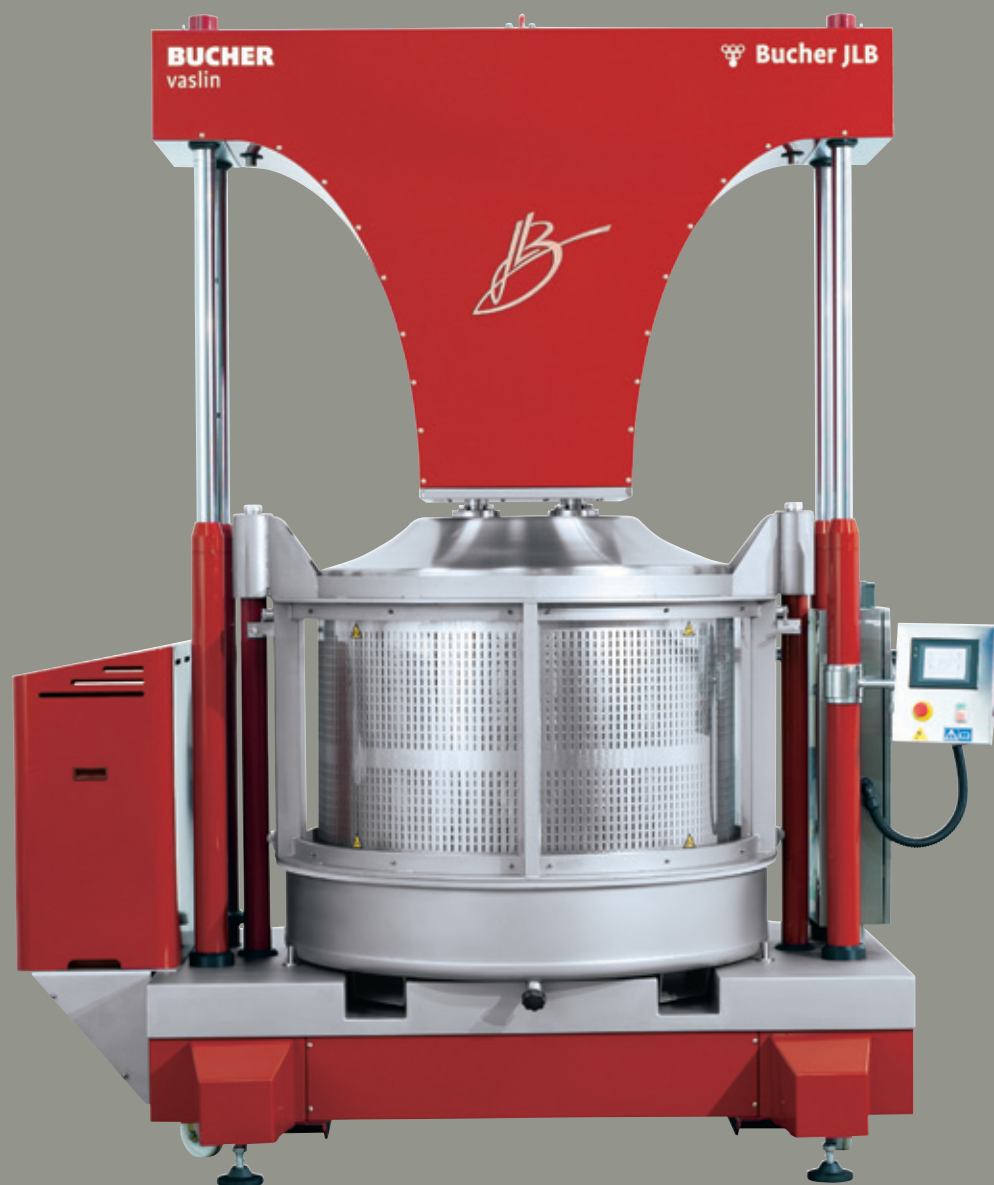
Bucher JLB 12