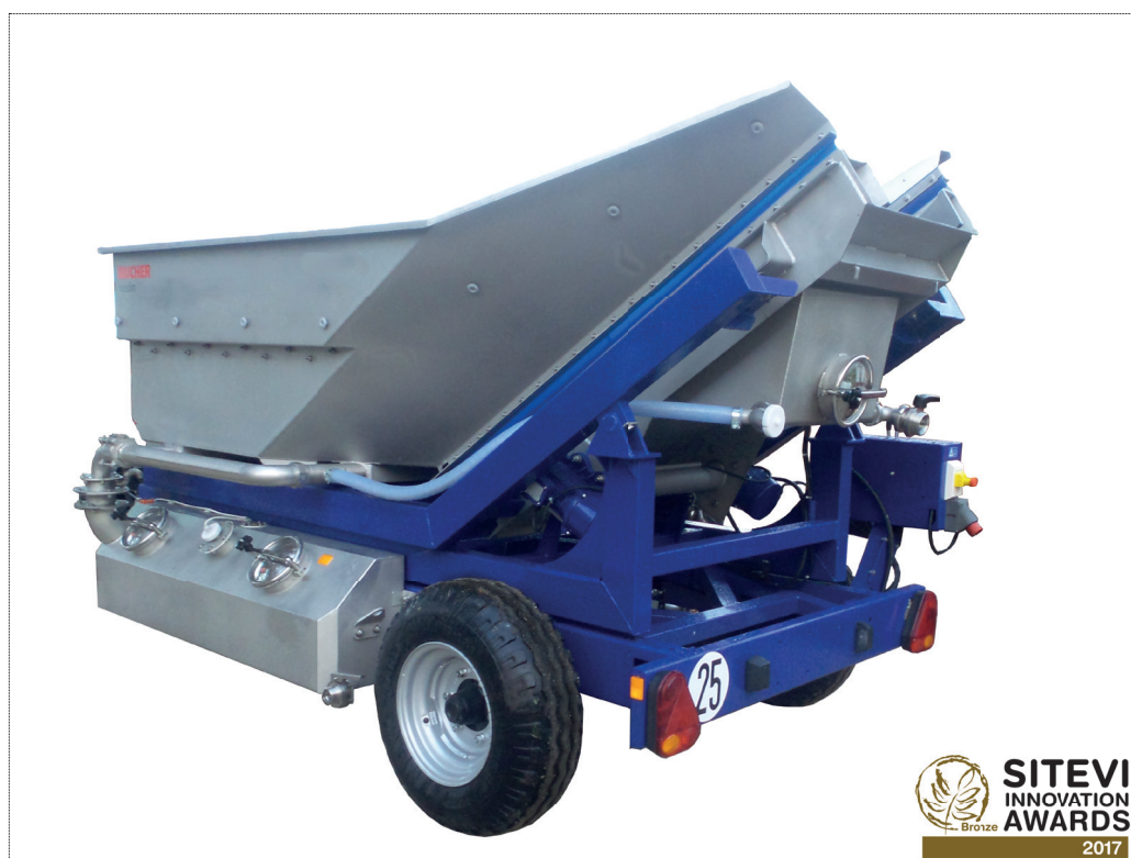
Delta REC 40