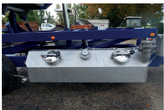
Two side tanks equipped with two access doors