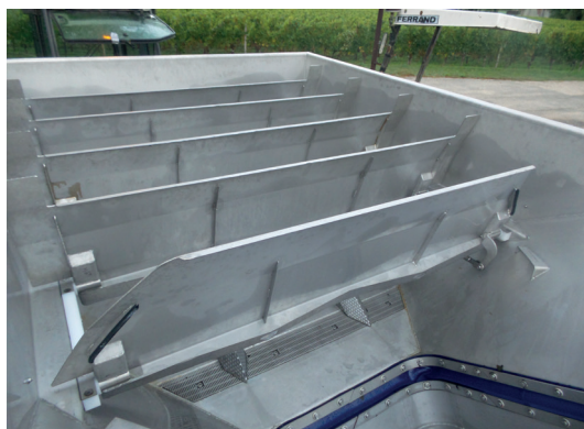
Tilting flaps with hydraulic control