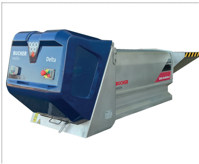
Delta Evolution 2