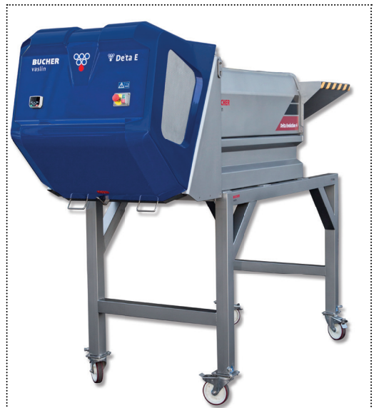
Delta Evolution 4