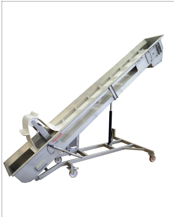
Delta ELVTR 300