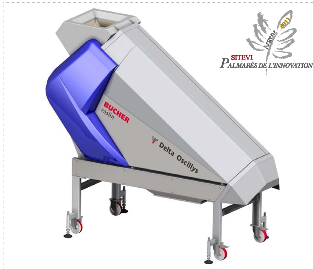
Delta Oscillys 100