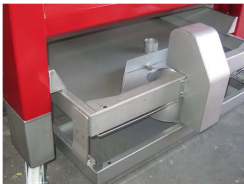
Dynamic trough for the reception of juices Rear view of press