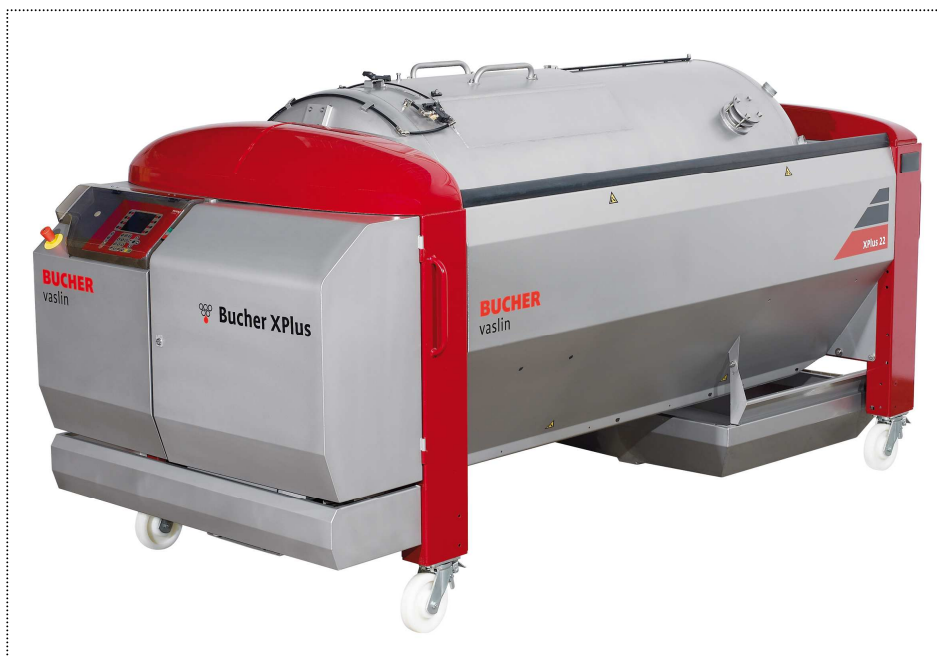
Bucher XPlus 22