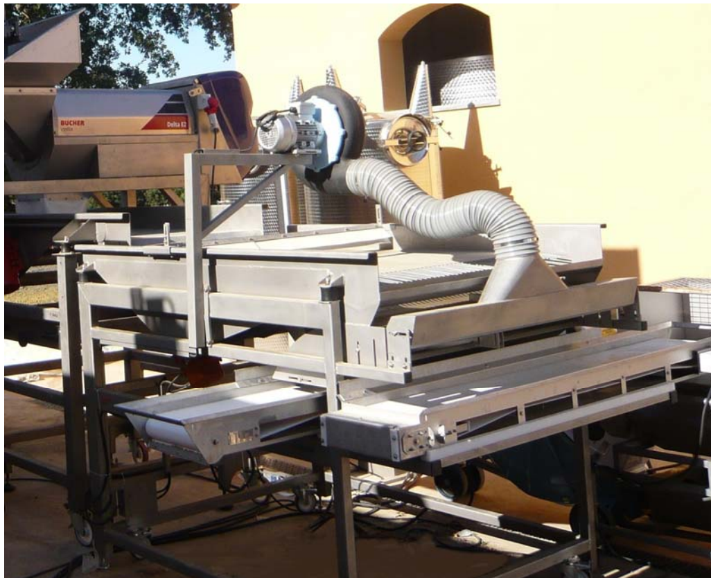
Delta Mistral ® 140