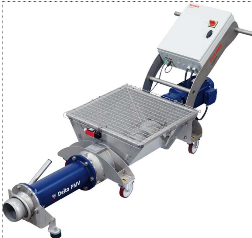
Delta PMV 2

In the heart of the vinification process, the Delta PMV pumps receive the fresh grapes and are adapted to the transfer of fermented pomace (except for Delta PMV1).