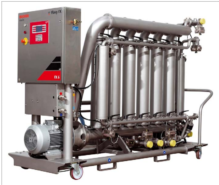
Flavy FX 6

The new Flavy FX 5 and FX 6 filter range is the best answer to large wineries and co - operatives.