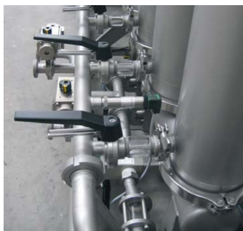
Sight-glasses and isolating handles of modules